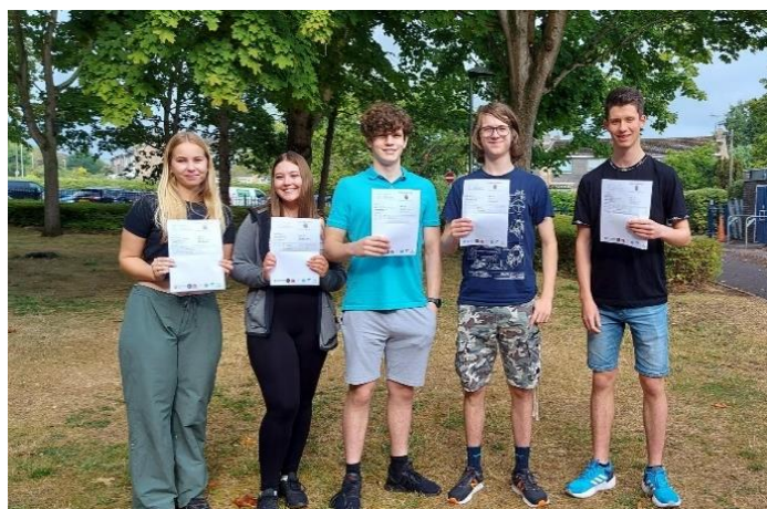
High-achieving Yateley School Students

The following subjects all achieved particularly highly, with at least 75% of students gaining an A*-B grade; Art, Computer Science, Further Maths, Politics, Psychology, Religious Studies, and Childcare.