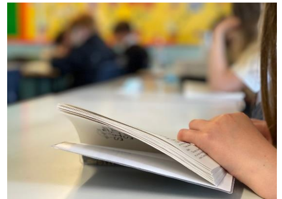
improved vocabulary and ultimately better success in public exams is proved beyond doubt and we want our students to benefit from that as we develop and improve in the future. The reading programme will be extended in September.