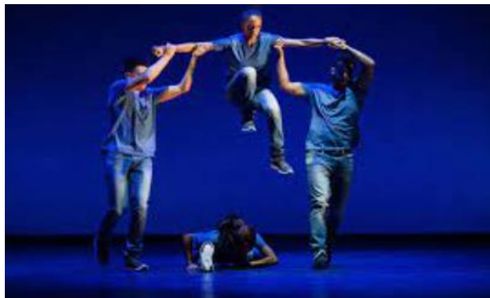
Emancipation of Expressionism by Boy Blue Entertainment