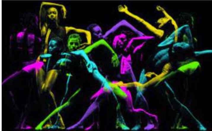
A Linha Curva performed by Rambert Dance Company

'Hairspray' and Year 11 will perform a Charleston Dance! Year 10 have been busy learning about two professional works this term: A Linha Curva and Emancipation of Expressionism and Year 11 have successfully completed their performance exams as well as prepare for the GCSE Dance theory exam in the new year. Good luck year 11!