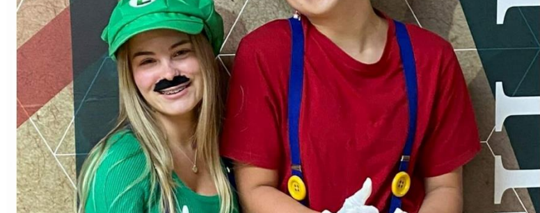
RAG (Raising and Giving) Week Throughout this week