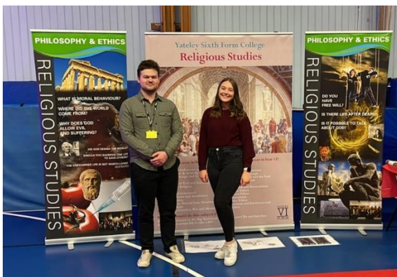
Sixth Form Open Evening