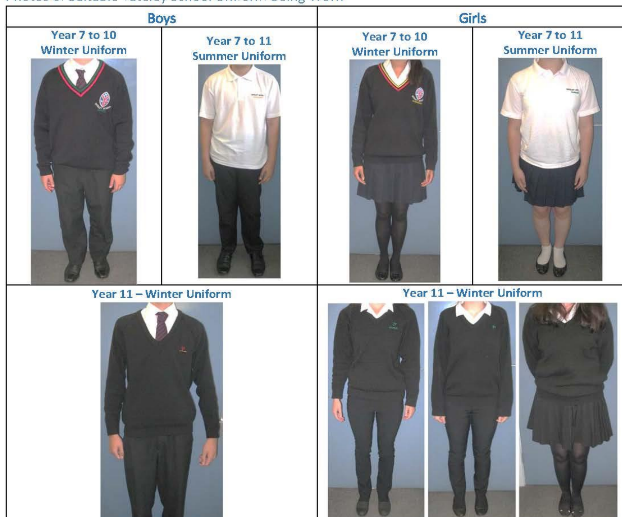
Photos of Suitable Yateley School Uniform Being Worn

The longer lengths are much less popular and therefore not many are held in stock. For very tall, slim girls KT Textiles can source a ladies work trouser from Alexandra which is plain and similar to the school trouser (this would not be kept in stock at KT Textiles). This would be available as small as a size 6 with an XL 36" inside leg, so KT Textiles can cater for any size in trousers. These non-stocked trousers would need to be on an order only basis and dependant on stock at the time. If a parent ordered then KT Textiles would usually get these within 3 working days if Alexandra have stock.